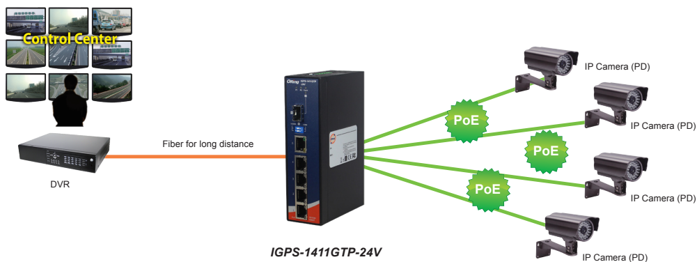
Connections of Ethernet devices

IGPS-1411GTP-24V can be used in connecting several PoE P.D. Ethernet devices like IP-Camera or other Ethernet devices. In addition, there are two different power inputs at terminal block to avoid interruption caused by power down. When the primary DC power input fails, the backup power input will take over immediately to guarantee a non-stop operation.