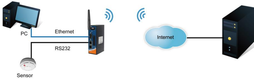
M2M Gateway Connection

IMG-311DL-MN LTE Cat-M1 or Cat-NB Modem dial up. The utility- M2M-Tool which is used to manage and monitor all of the serial ports on IMG-311DL-MN.